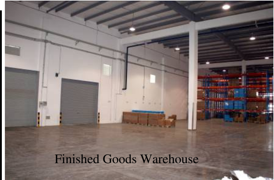
Finished Goods Warehouse