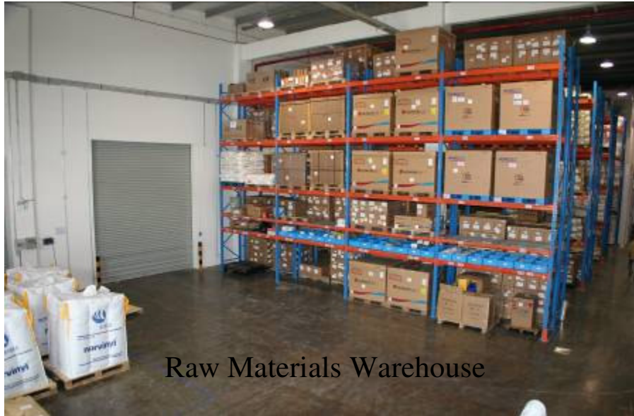
Raw Materials Warehouse