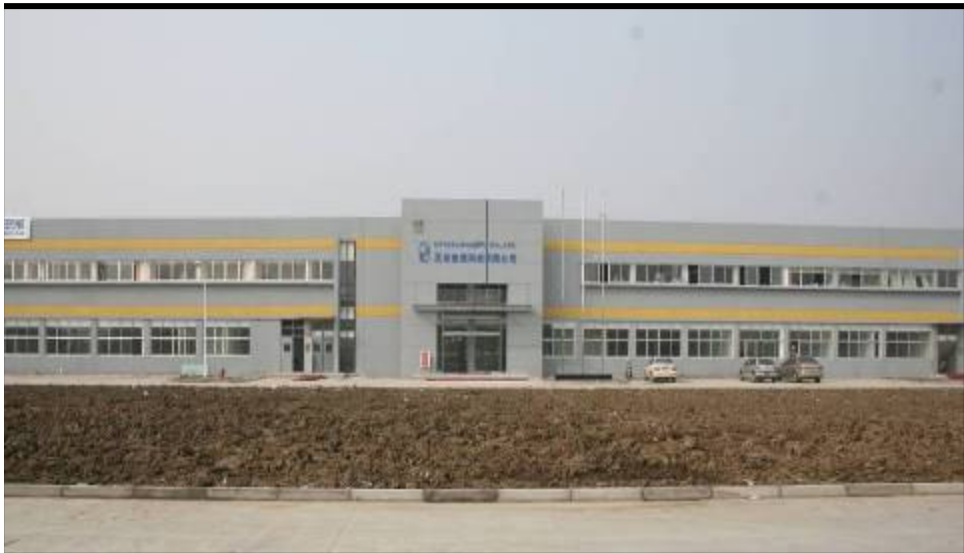
Park Entrance & Plant Front Views