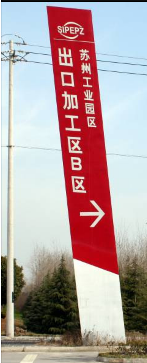
Entrance “Export Processing Zone”